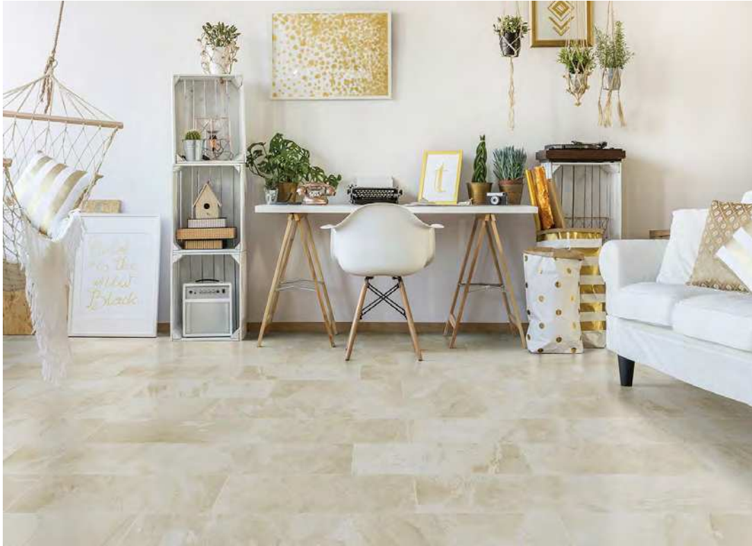
Features Beige MD01 12" x 24"

Mod: Slate Porcelain™ marries strong, alluring graphics, emulating the grand beauty of slate, with a fundamental color palette of beige, gray and charcoal. This series' 12" x 24" size is the foundation for stand-out, timeless design. A 2" x 2" mosaic and a 4" x 12" bullnose complete its size package.